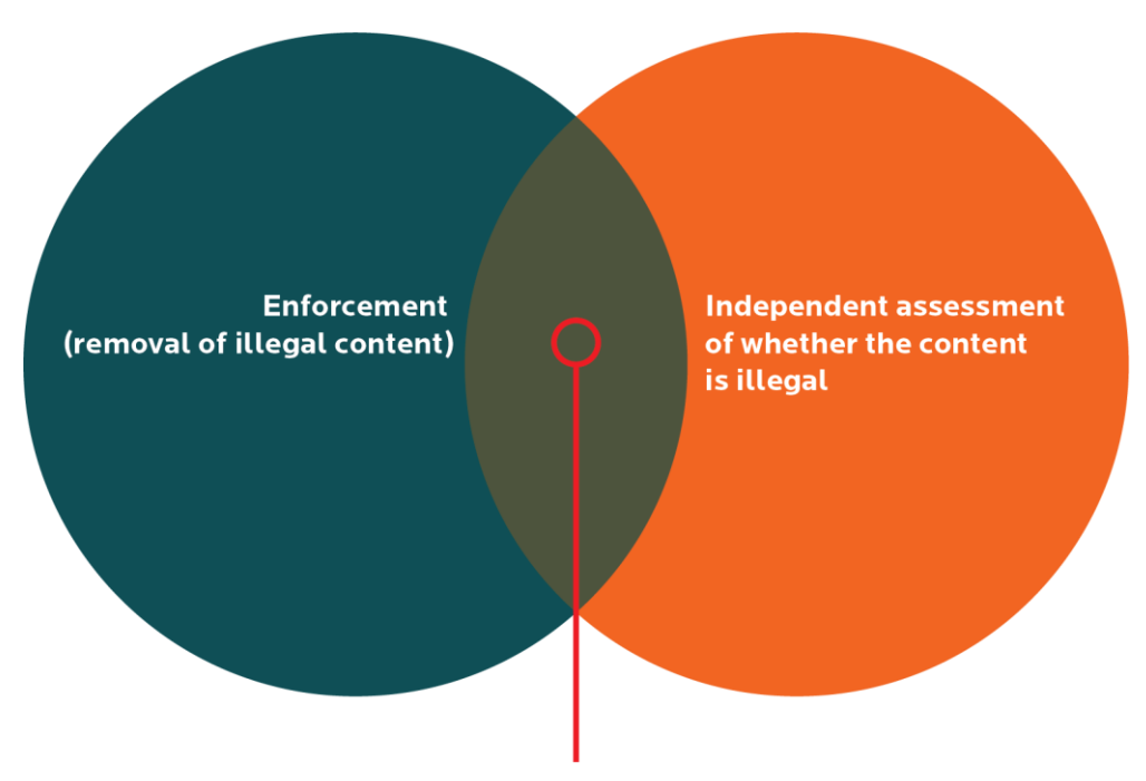
Content that is "identical" or is "equivalent to" illegal content.

In this context, it is key to distinguish between the independent assessment of whether the content is illegal on the one hand, and removal of content ( enforcement ) on the other.