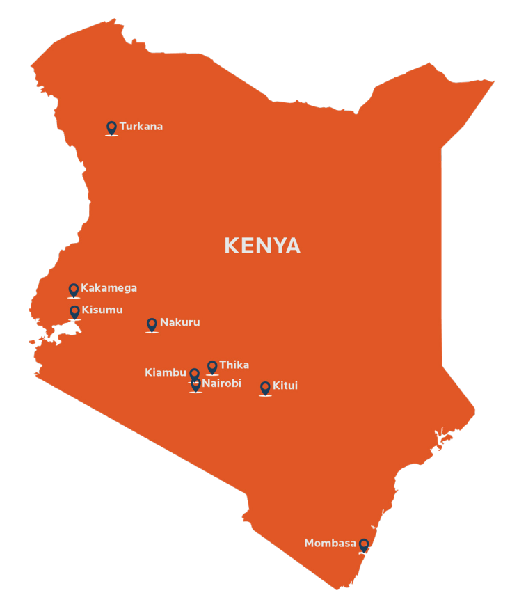
FIGURE 4 : LOCATION OF REGIONAL CONSULTATIONS ACROSS THE COUNTRY

Figure 4 below, illustrates the spread of regional consultations across the country.