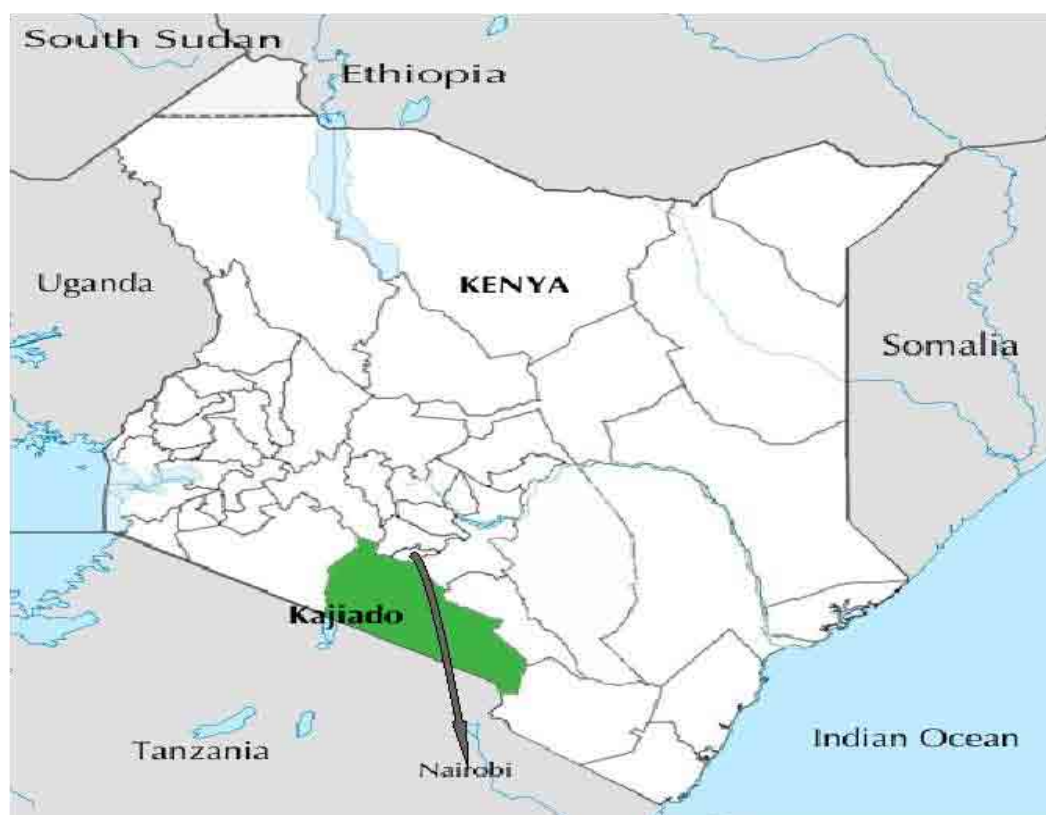
Figure 2 – Map of Kenya highlighting Kajiado County