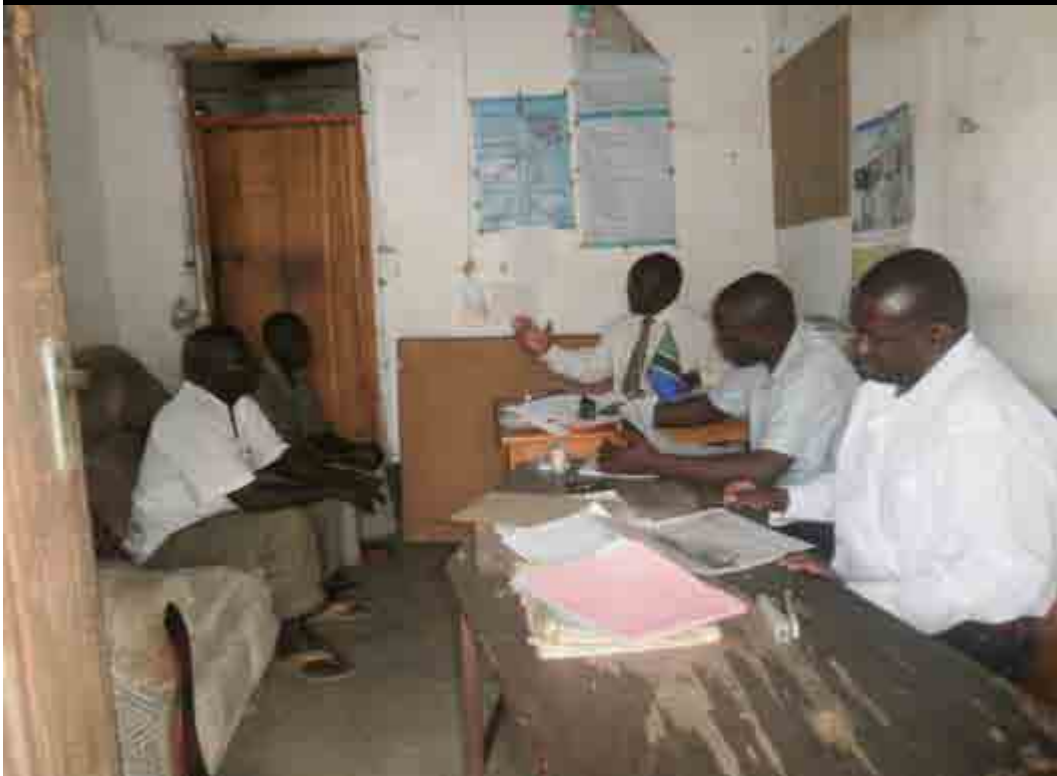
Figure 4: The Mediation Committee Meeting Kombo Mtaa in Progress

In civil disputes the mediation committee can order the disputant defendants (most are adults): to provide basic needs to a child disputant such as food, clothing, paying school fees and taking a child disputant to school. As indicated earlier, issues not satisfactorily resolved by the mtaa mediation committee (as a first instance), are referred to the ward tribunals. An appeal can be made by: the child, or the child's parent or guardian on their behalf.