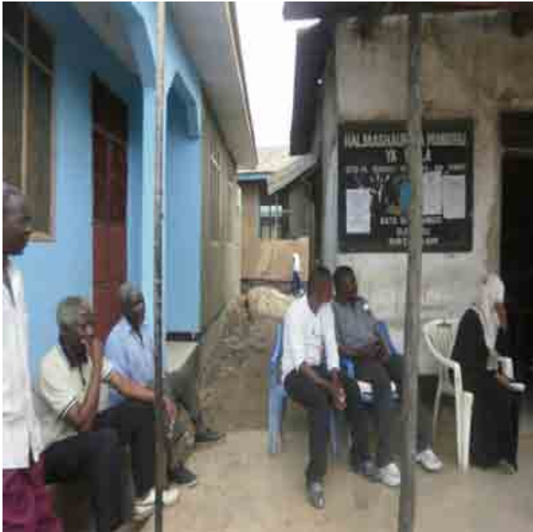
Figure 3: Citizens waiting to attend the Kombo Mtaa Mediation Committee